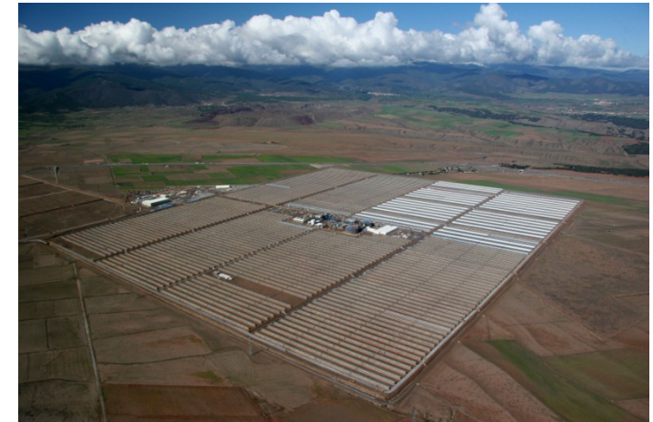
Figure 1. The Andasol solar power station, occupying 2 km 2 of land in Andalusia, Spain. It produces a peak output of 100 MW of electricity, and 42 MW of electricity on average, equivalent to 20 W/m 2 .

Level 4 assumes that by 2050 the land area occupied by solar power stations in the countries exporting energy to the UK is 1000 km 2 , assuming a power per unit area of 15 W/m 2 . This is two-thirds of the area of Greater London and generates 140 TWh/y. The interconnector to France needs 20 GW of extra capacity. This level also requires grid enhancements in the UK enabling an extra 16 GW of electricity flow. This 140 TWh/y equates to every person in Britain having either 12 m 2 of overseas solar photovoltaic panels or 4.6 m 2 of mirrors in a concentrating solar power station.