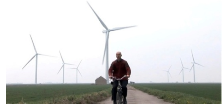
Figure 1. Red Tile wind farm, East Anglia. Each turbine has a capacity of 2 MW

Level 4 assumes that capacity rises to 34 GW by 2025, then to 50 GW by 2050, with a sustained installation rate of about 1000 turbines per year. There are significant interconnection and storage requirements, as discussed in the section on 'Storage, demand shifting and interconnection'. The level 4 output of 132 TWh/y could be delivered by about 20 000 2.5-MW turbines in 2050, although in reality we would expect turbine capacities to increase over that time period. The total area of the wind farms would be about 6000 km 2 , or 2.5% of the UK. If 20 000 turbines were spaced evenly alongside all of Britain's motorways, dual carriageways, and trunk roads, there would be one every 600 metres.